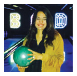
The author was hosted by Global Panorama Showcase (GPS)